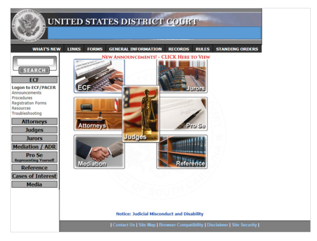
Figure 2 : Website with an Accessibility Issue—Example 2. This website has a great deal of empty space, which registers as linked artifacts to a screen reader. This makes people with a screen reader think there is pertinent information which is simply not coded properly when in fact there is nothing of value on that portion of the screen.

Figure 1 : Website with an Accessibility Issue—Example 1. This website displays a feature that decreases its accessibility to people using screen reader software. The slide show numbers are read by a screen reader as "1," "2," and "3." However, there is no indication as to what these numbers are in reference to when using a screen reader.