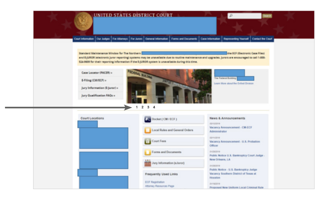
Figure 1 : Website with an Accessibility Issue—Example 1. This website displays a feature that decreases its accessibility to people using screen reader software. The slide show numbers are read by a screen reader as "1," "2," and "3." However, there is no indication as to what these numbers are in reference to when using a screen reader.